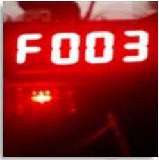
Message from the Kitchen to Collect Table 3 meal