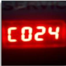
Sample Call from Table 24